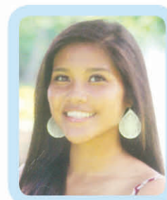
SCHOLARSHIP Takeshi Fujita Society | COLLEGE Washington State University | CAREER GOAL Teacher

Waimea Alumni & Friends Foundation (WAFF) is proud to present scholarships to nine outstanding members of Waimea High School Class of 2017. These students have demonstrated academic excellence, perseverance in athletics, leadership in class and student government offices and committees and unselfish hours in school and community service.