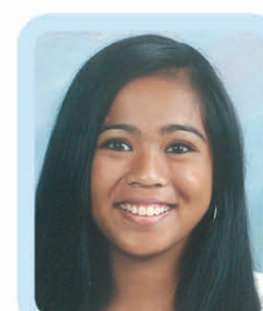
SCHOLARSHIP WAFF | COLLEGE Seattle University | CAREER GOAL Pediatrician