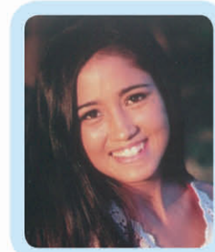
SCHOLARSHIP Daniel Suga Memorial | COLLEGE UH Hilo | CAREER GOAL Personal Business