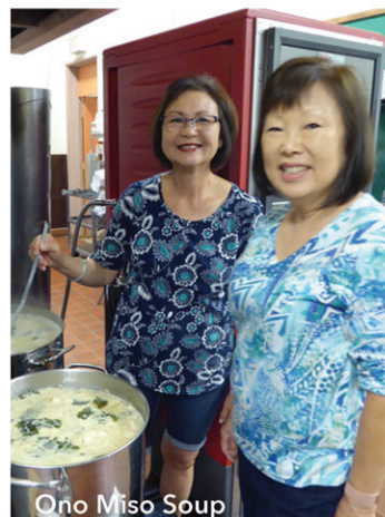
Ono Miso Soup