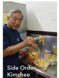
Side Order Kimchee